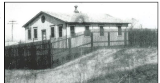
Pest House c. 1935-1941

What happened to the Pest House? When was it built? Did your family stay there? There is more to learn about this interesting piece of Roebling's past. If you have any information about the Pest House or other lesser known bits of Roebling history, be in touch to share your story.